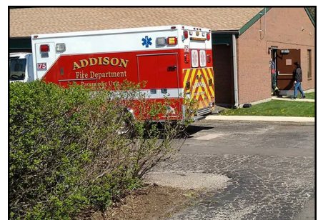
Advantage Wood Dale 4/18/17

Vote NO on SB 1942 and HB 2495, the Reproductive Health Act!