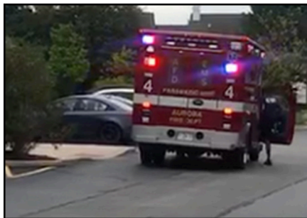
Planned Parenthood Aurora 8/17/18

NOTE: Documentation available upon request from the Pro-Life Action League, (773) 777-2900, info@prolifeaction.org.