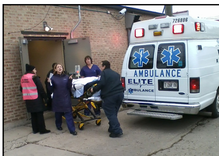
Albany Med/Surg Ctr Chicago 12/20/14