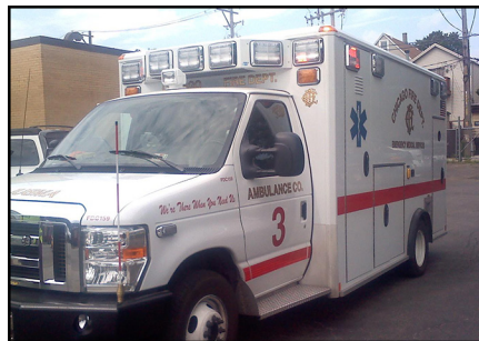
Am Womens Med Ctr Chicago 6/28/14