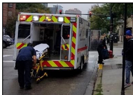
Planned Parenthood Chicago 10/6/15